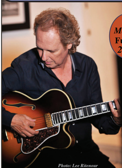
Photo: Lee Ritenour

Venerable guitarist Lee Ritenour is now 68 years old with decades of recordings and performances behind him. He has nothing to prove having starred on countless jazz fusion contemporary albums that risen to the top 10. Dreamcatcher is his first solo album, perhaps a result of pandemic reflections. He took the opportunity to reminisce with new tunes and old memories on a wide variety of guitars. He’s deliberate and precise with impactful melodies over a dozen selections. Excellent liner notes for each selection enhance the listening experience.