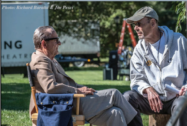
Photo: Richard Baratta & Joe Pesci